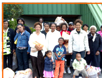
Some of the women and children who celebrated the day with us.