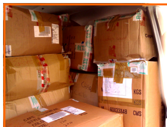
Boxes of clothing from Woolworths

The afternoon ended off with the greatest indulgence of all with the distribution of bundles of clothes thanks to the very kind donation by Woolworths via Greater Good South Africa!