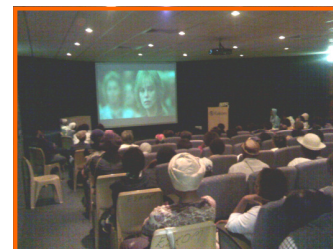
The cinematic experience!