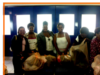
Happy clothing recipients!