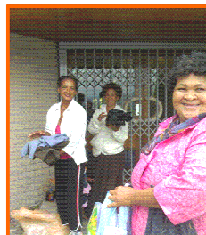
Some more happy recipients of clothing donated by Woolworths!